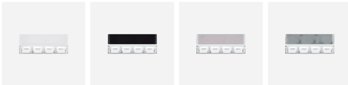
EN White IT Bianco