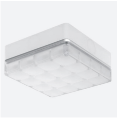
Cells Opal Diffuser